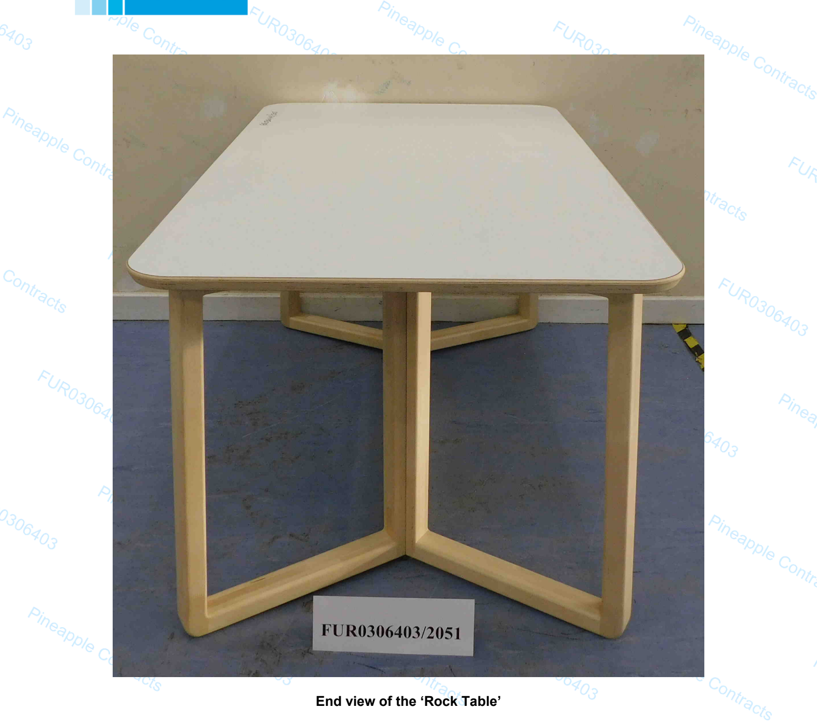
End view of the 'Rock Table'

SATRA Report Reference: FUR0306403 2051 Report ID/Issue number: 14721/1