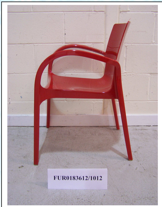
Side View: Xeon PA6 Nylon Colour Chair