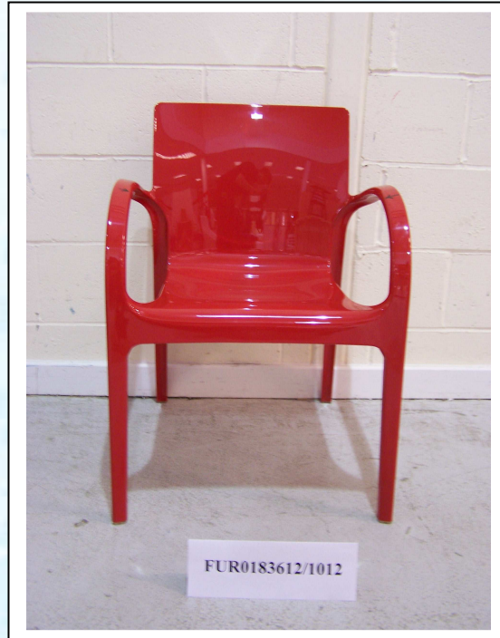
Front View: Xeon PA6 Nylon Colour Chair