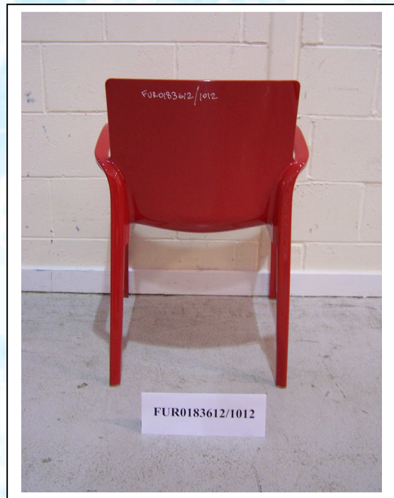
Rear View: Xeon PA6 Nylon Colour Chair